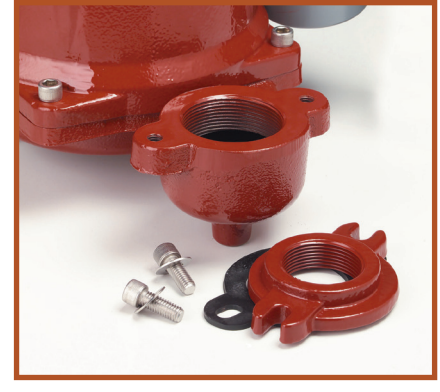
Dual Sized Discharge 1-1/2" or 2"